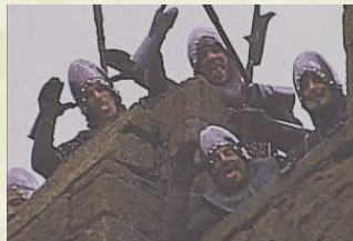
A Note from the Editor!